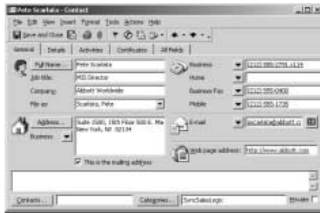
Move SalesLogix contacts into Outlook (and into the PDA of choice) with just one click.

and from Outlook, you won't need to worry about it. Your calendars and contacts will always be in sync. Of course, you can always sync on command with a simple menu selection.