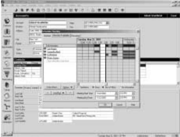
Check Outlook user's availability right inside of SalesLogix.

Enter contact information once, see it in both places