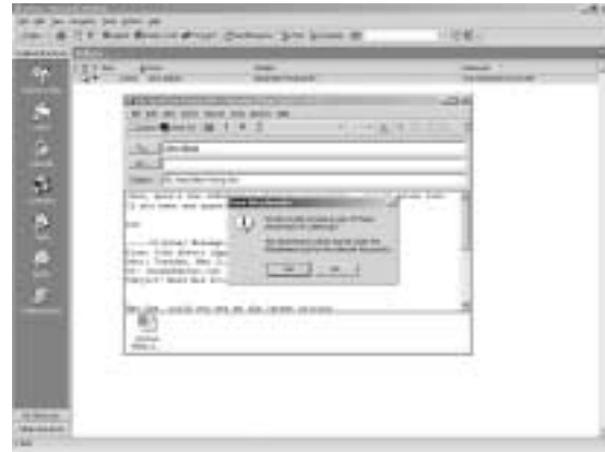
Keep track of Outlook e-mail attachments within relevant SalesLogix accounts.

your crowded Inbox—and give them the attention they deserve.